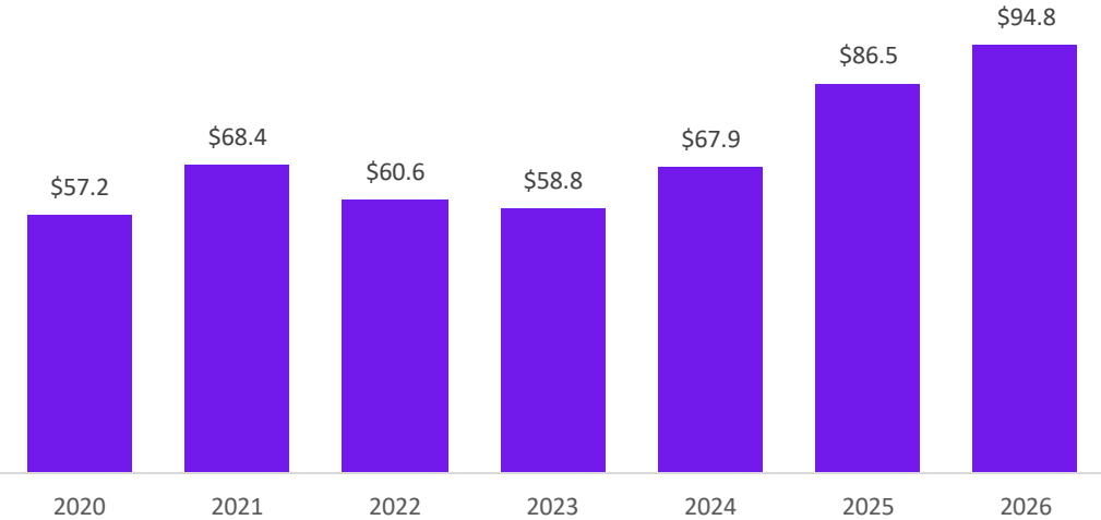
Global Revenue Forecast – NAND Memory ($-billions)

Part of the Memory & Storage Service Area Package